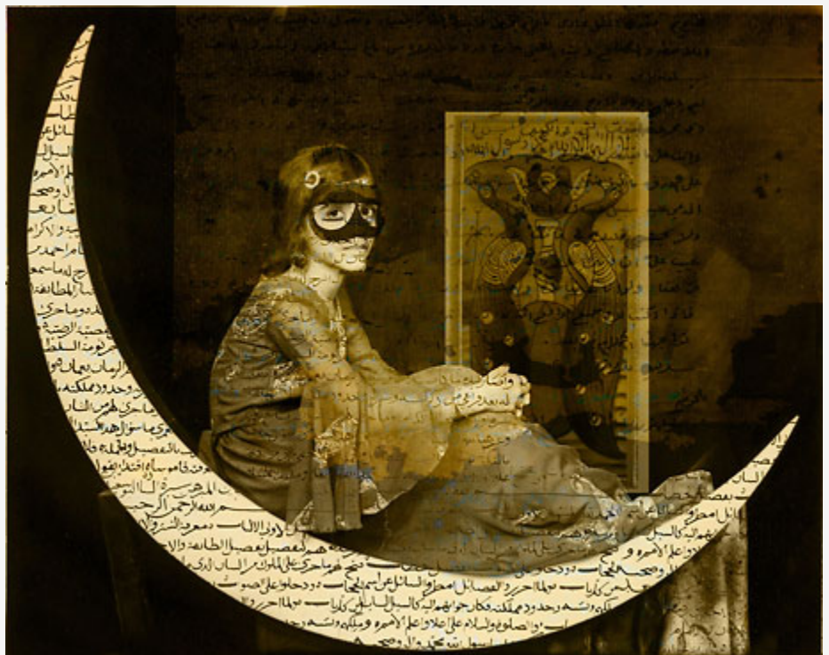
Zulika and the Moon